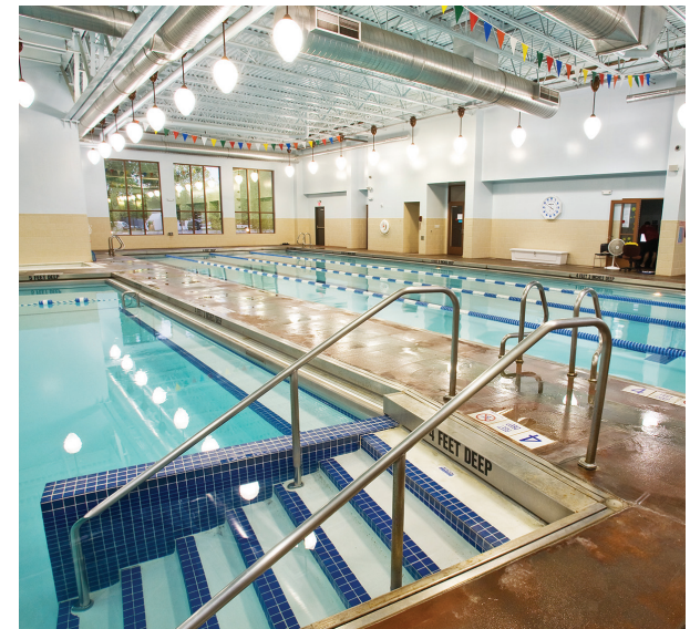
Pool for aquatherapy at Island Health Center

Cayuga Medical Center Physical Therapy was credentialed by the American Physical Therapy Association in 2010 with the first Physical Therapy Orthopedic Residency program in New York State.