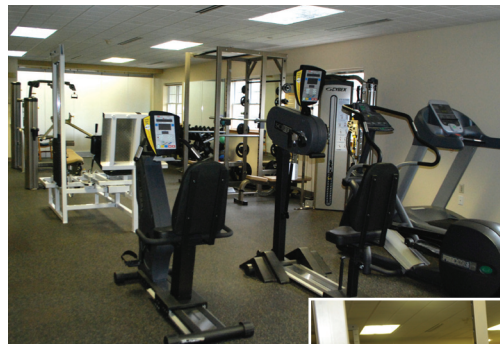
Brentwood Location (PT, OT, Speech)