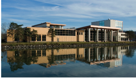
Island Health Center Physical Therapy 310 Taughannock Blvd. Ithaca, NY 14850 (607) 252-3500