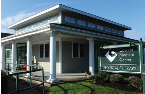
Brentwood Physical Therapy 10 Brentwood Dr., Suite A Ithaca, NY 14850 (607) 274-4159