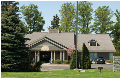
Cortland Physical Therapy Cortland Convenient Care Center 1129 Commons Ave. Cortland, NY 13045 (607) 252-3500